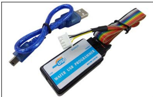
USB program adapter box

The bellow wire picture is to show how to connect the cable to the PC program connector with the Program adapter.Please connect it in the right direction with the picture.